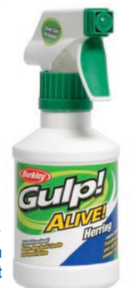
Gulp Alive Fish Attractant

Now anglers can give any bait or lure the scent of Gulp Alive. The 8-ounce trigger spray bottles are available in four saltwater flavors: crab, herring, shrimp and squid. www.berkley-fishing.com; 800-237-5539