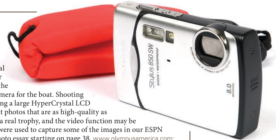
Stylus 850 SW

Although the SW in this camera's name doesn't stand for saltwater, it should. Because it is shock-proof and waterproof (the real reason for the SW), an angler will be hard-pressed to beat the Stylus 850 SW as a digital camera for the boat. Shooting at 8.0 megapixels and featuring a large HyperCrystal LCD display, this camera turns out photos that are as high-quality as the viewing platform. Catch a real trophy, and the video function may be appropriate. These cameras were used to capture some of the images in our ESPN Outdoors Saltwater Series photo essay starting on page 38. www.olympusamerica.com; 888-553-4448