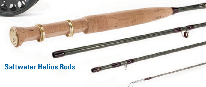
Saltwater Helios Rods

The new Helios blank is nearly one-third lighter than the Zero Gravity blank, yet it's a strong, fast blank that combines the highest-quality components into a top-of-the-line rod. www.orvis.com; 888-235-9763