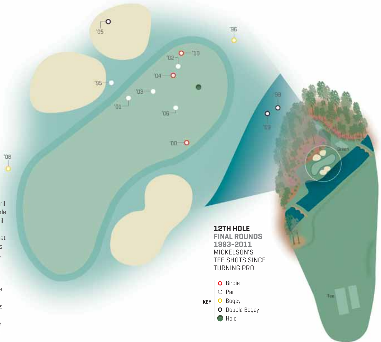
12TH HOLE FINAL ROUNDS 1993-2011 MICKELSON'S TEE SHOTS SINCE TURNING PRO

Still, for all the hard-drawing 9-irons Phil has peppered the green with on 12, he's had nearly as many fozzles there. He's 4-under par on the hole in his three wins and 15-over the other 15 years. His low point came in 2009 when a wet double bogey negated a front-nine 30 that had pulled him to within one of the lead. Regardless, Phil the Thrill remains consistent in his approach: He's firing at the 12th pin—swirling wind, Rae's Creek and back-nine double bogeys be damned.